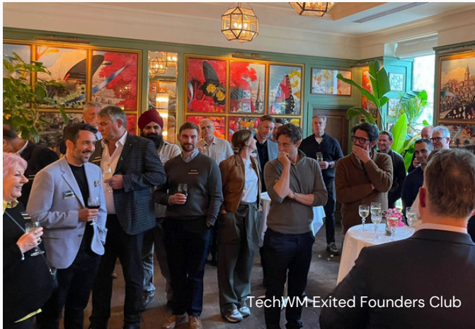
TechWM-Exited Founders Club

Projects that contributed to this achievement include: