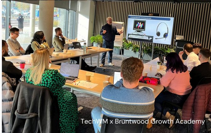
TechWM x Bruntwood Growth Academy