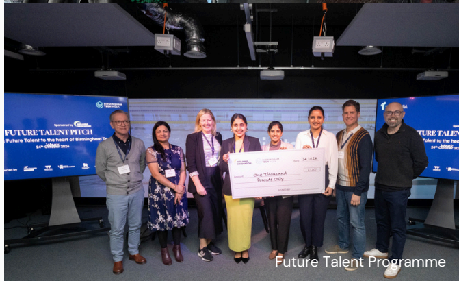
Future Talent Programme

TechWM Investment Project with Midlands Investment Forum